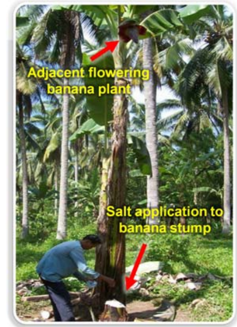
B. Effect on the 'bugtok' disease incidence of 'Cardaba' banana under 'LAGT' palms, PCA-DRC, 2006-07.